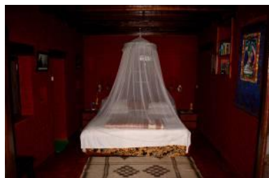
Poinsettia Cottage - double