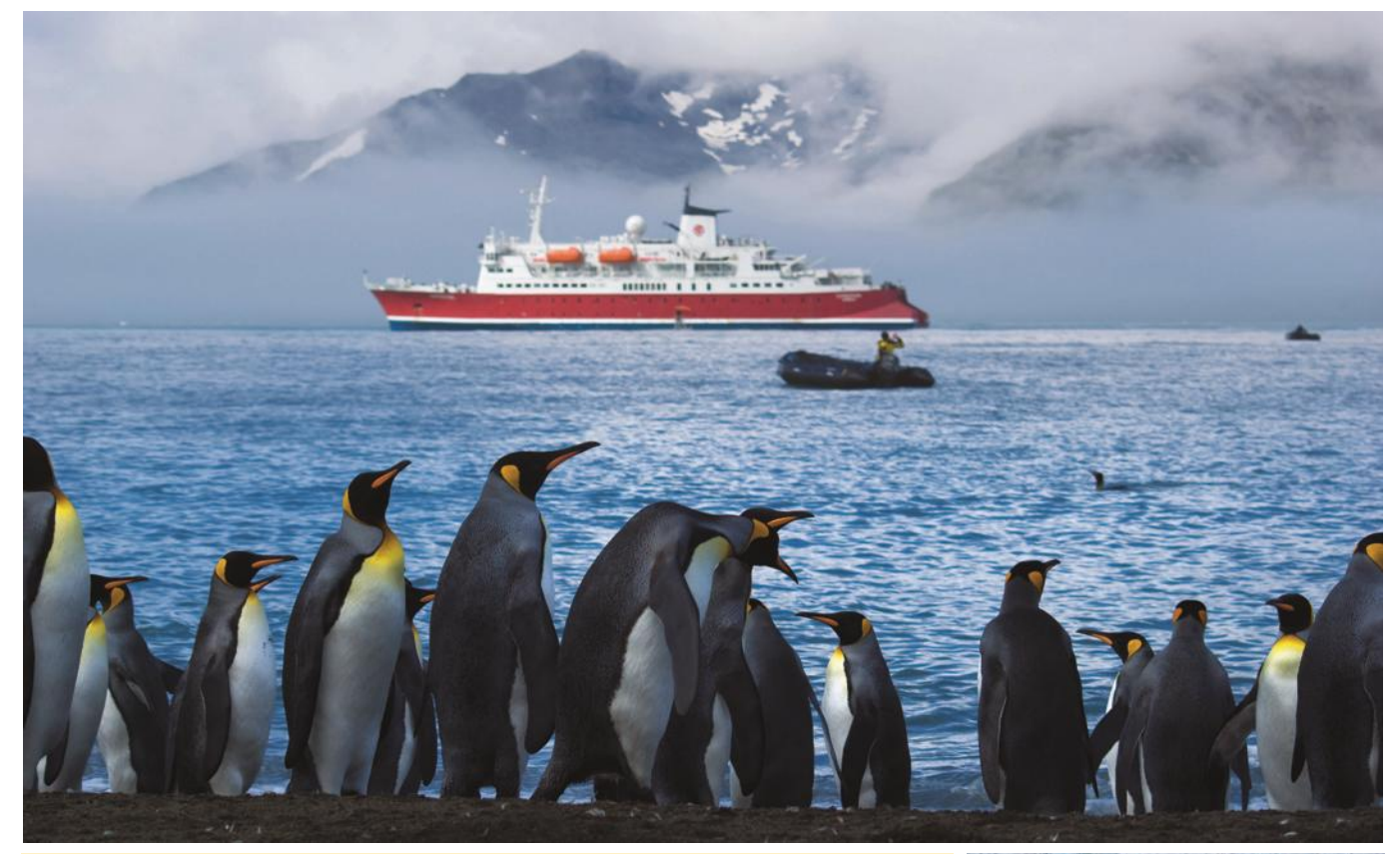
Group departures See overleaf for departure dates

Discover the abundant wildlife and the unrivalled landscape of the Falkland Islands, South Georgia, the South Shetland Islands and the Antarctic Peninsula