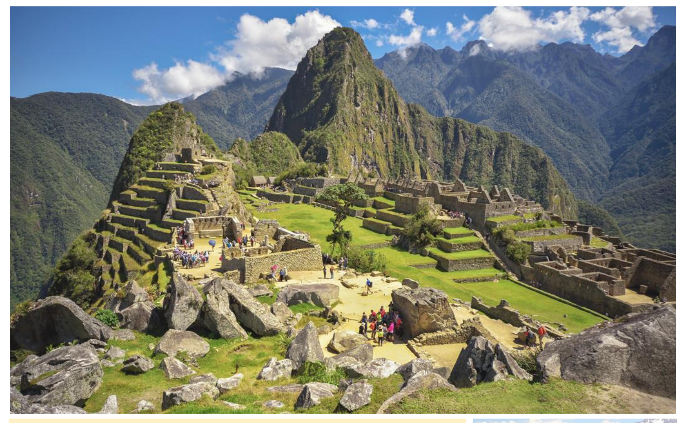
Group departures See overleaf for departure dates

Explore the Sacred Valley of the Incas and trek one of the most celebrated trails in the world.